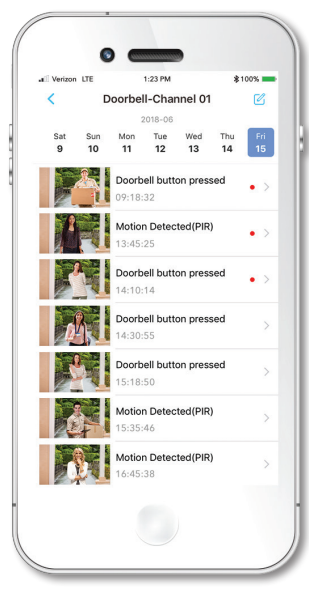
Cloud-based time stamped video archive (12mos, incld)