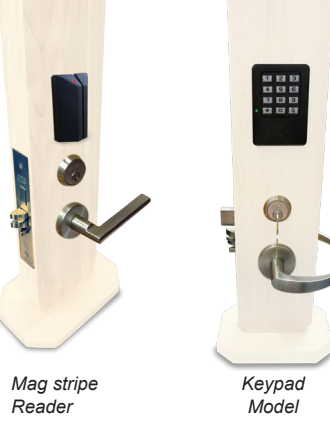
Note: Please consult technical documentation for complete specifications.