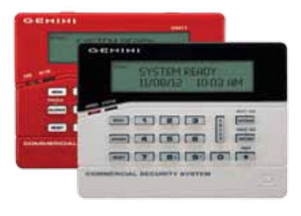
Scalable Commercial Intrusion and Fire Alarm Systems

Regardless of the size of your business, Gemini provides comprehensive security, fire & and optional