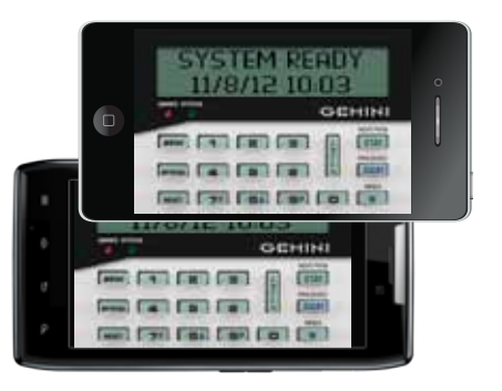
iRemote Virtual Keypad App on Smartphones

archived time-/ date-stamped video stored for you. Plus, you can get alarms, open, close reports and other system alerts in the palm of