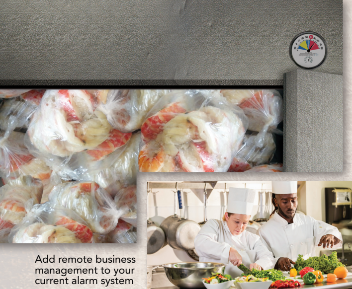
Add remote business management to your current alarm system

Our App keeps you actively connected and in charge. You'll have remote full system management controls, a virtual keypad that matches the one on the wall; you can add or remove staffers & permissions; assign access codes or deactivate ID cards; allow temporary late-night delivery access. Lock up, turn HVAC down or lights off, when someone else forgot. No more gas, money or your valuable time wasted.