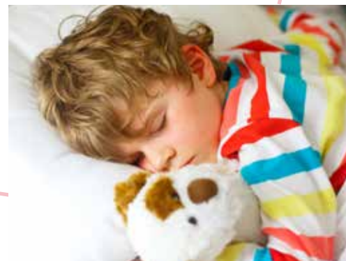
Rest easy knowing your home and family are protected around the clock from burglary or fire