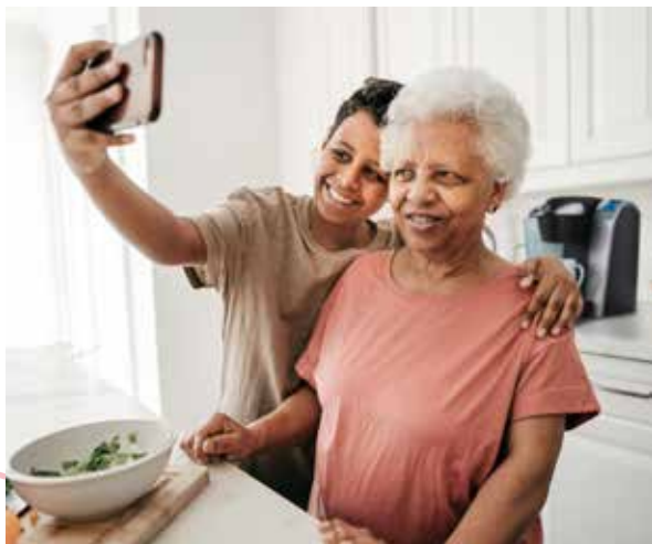
We all love our smart phones – now they can control lights, room temperature or appliances individually or grouped as one-touch "Scenes"