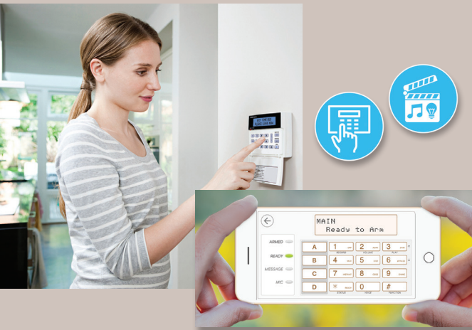
StarLink Connect's Remote Keypad App mirrors the one on your wall exactly and gives you total security control anywhere

Connected & monitoring your home system network, StarLink Connect reports to you with the Text Messages, Pictures or Video, you want to see, when you want to see them. If a door is opened or left open. If there's an alarm and the police respond. If someone arms or disarms your security system - as usual, or unexpectedly, you'll know who & when. You do your thing there. We'll keep you informed what's happening back home.