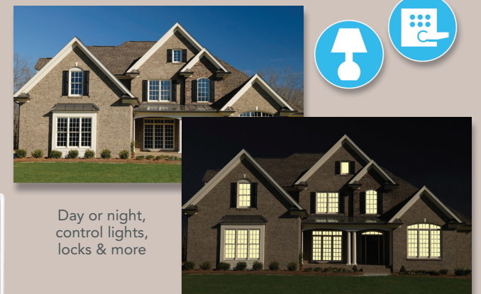
Day or night, control lights, locks & more