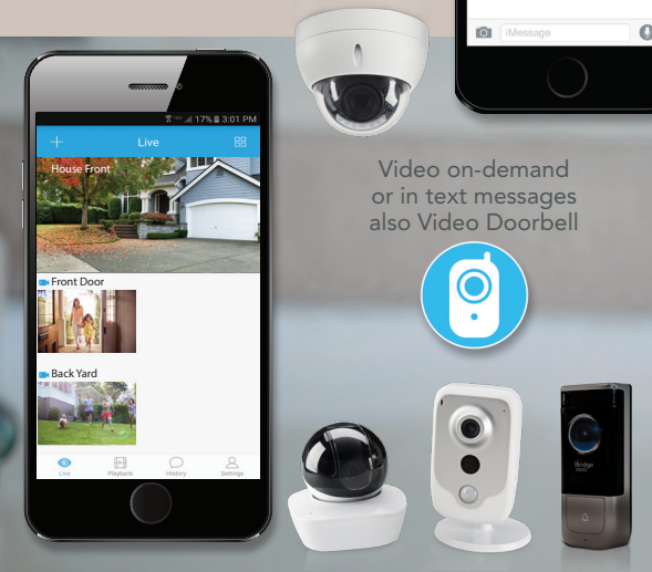
Video on-demand or in text messages also Video Doorbell