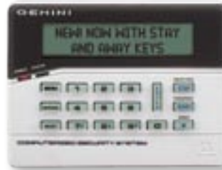
GEM-K1CA 4 built-in zones

Compatible with these standard Gemini keypads