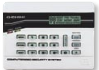
GEM-K4/K4RF with RF receiver