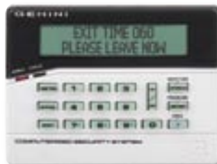
GEM-RP1CAe2 4 built-in zones