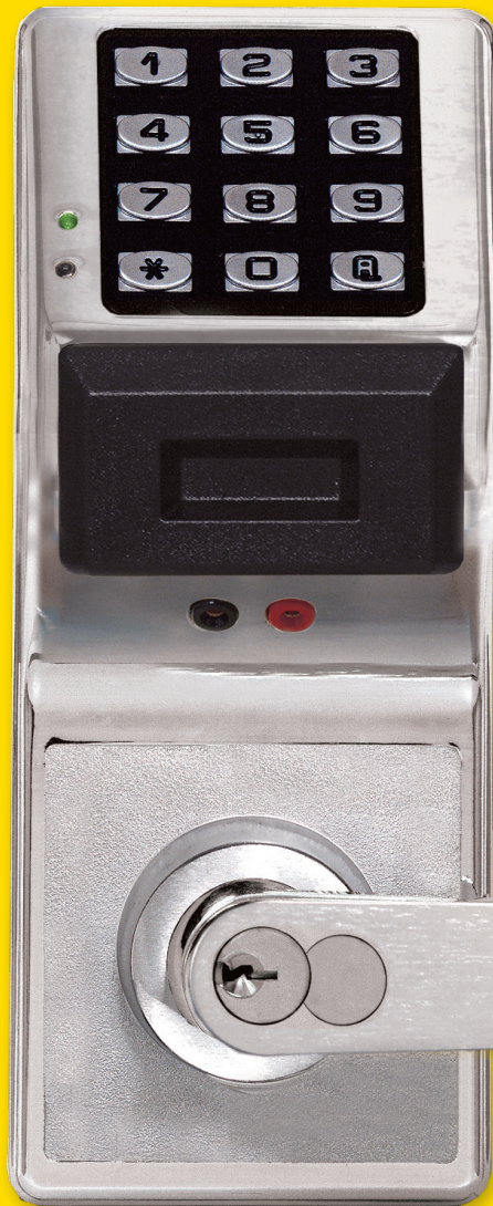
PDL5300IC Prox/PIN Lock front/back view, shown

Double-sided Trilogys for PIN code or prox access from 2 sides of the door