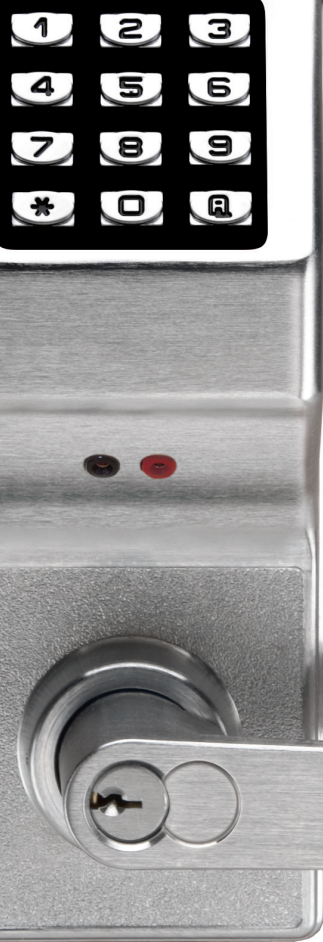
DL5300IC PIN Lock Front/Back View, shown