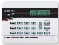
GEM-K4RF WITH 32PT RF RECEIVER BUILT-IN