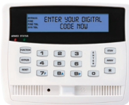
GEM-K1VPS WITH VOICE PIR & 88DB SIREN (GEMP1664, 1632 only)