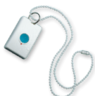
GEM-WP WATERPROOF PANIC