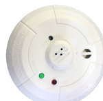
GEMC-WL-CO CARBON MONOXIDE DETECTOR