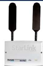
CONNECTED HOME/BIZ & SMS