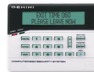
GEM-RP1CAe2 INCLUDES 4 ZONE EXPANSION MODULE BUILT-IN