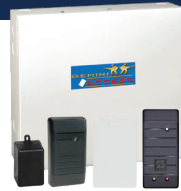
GEM-ACCESS FOR ALL GEMINI & MOST COMMERCIAL PANELS ADD-ON ACCESS MODULE