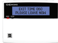
GEM-DK1CA INCLUDES 4 ZONE EXPANSION MODULE BUILT-IN