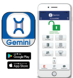
Gemini App CUSTOMIZABLE, PORTRAIT-STYLE APP WITH MULTI-TIER CONTROLS