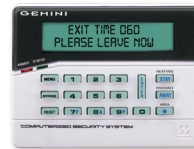
GEM-K1CA INCLUDES 4 ZONE EXPANSION MODULE BUILT-IN