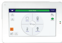
IBR-TOUCH /WL WIRED OR WIRELESS MULTI-FUNCTION SECURITY/VIDEO-VIEW/IOT TOUCHSCREEN (7", 1024 X 600 TFT) †